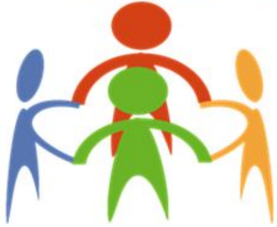
Disaster Relief Resources